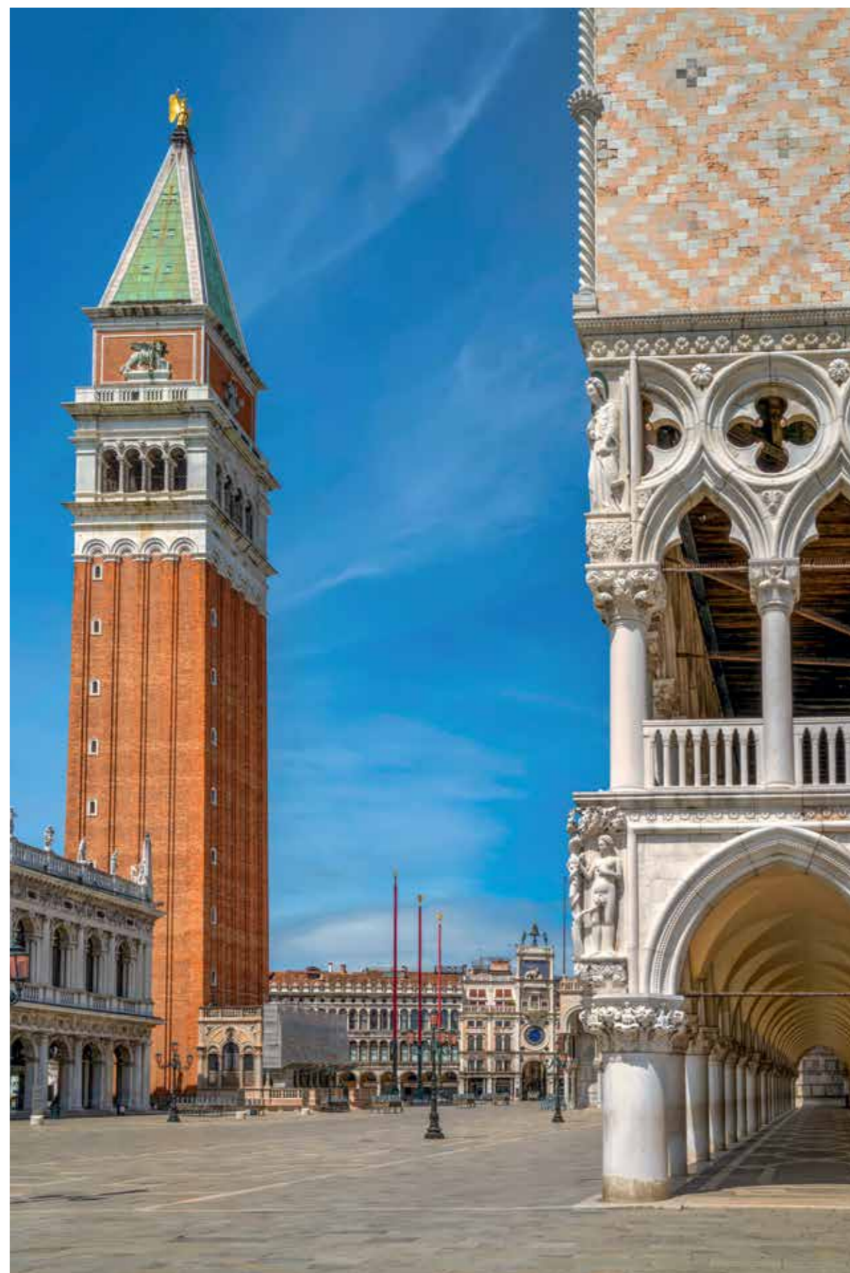
Campanile San Marco