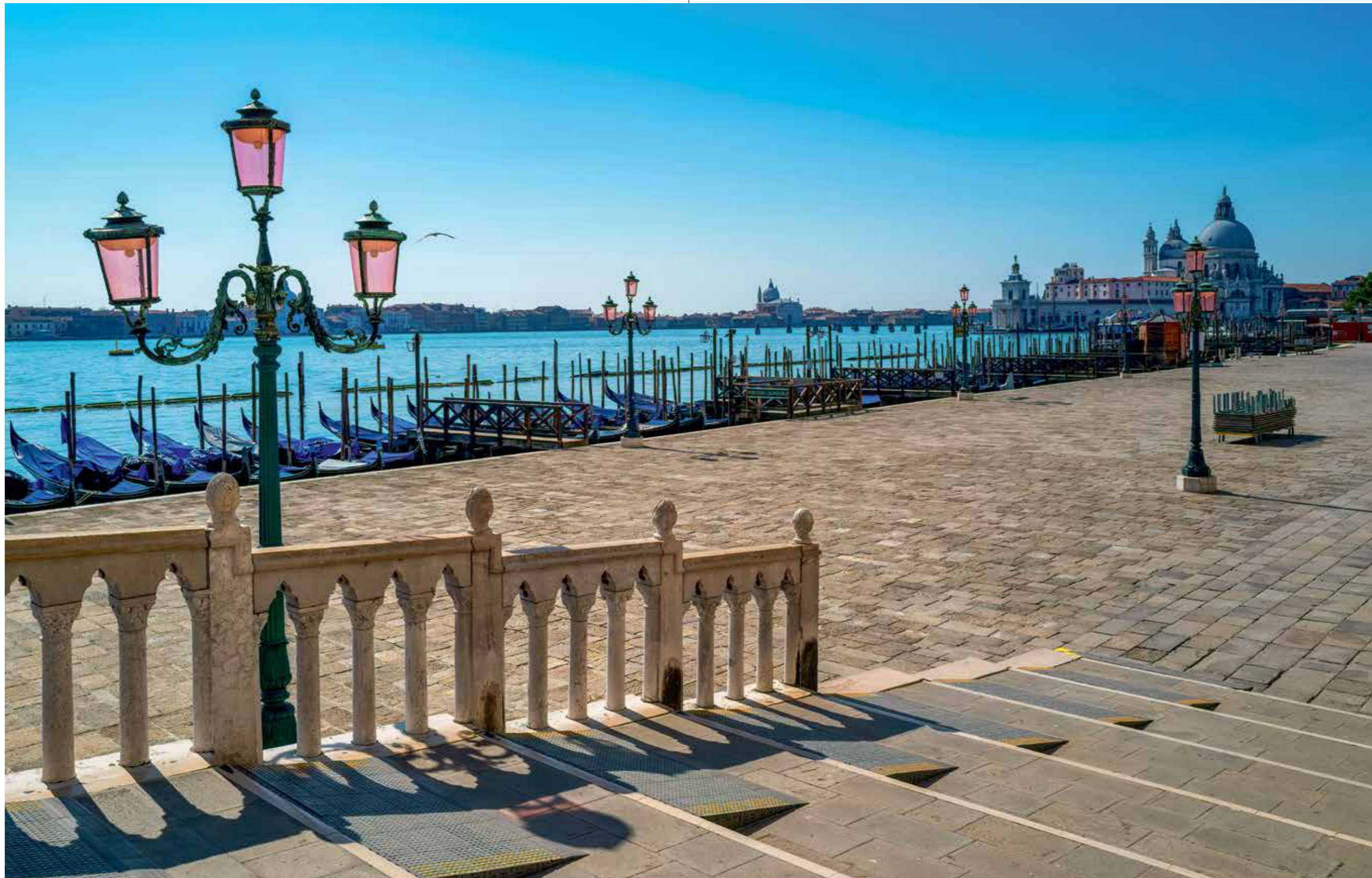
◀ Molo San Marco